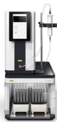
Pure Essential Chromatography System